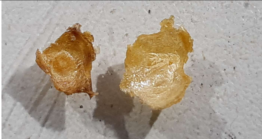
The images above show the underside of pupal cappings of 18 day old pupae. The one on the left has been un-capped and re-sealed, the one on the right shows an intact silk pupal skin and has not therefore been uncapped and re-sealed.